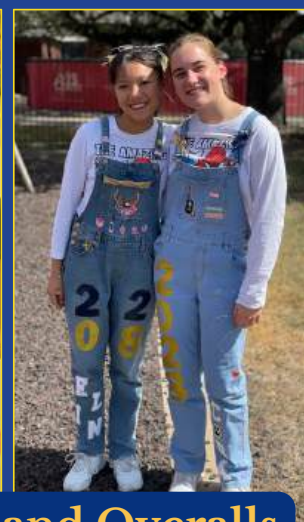
Hoco Shirts and Overalls