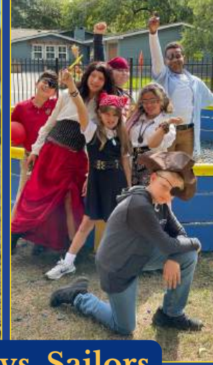
Pirates vs. Sailors